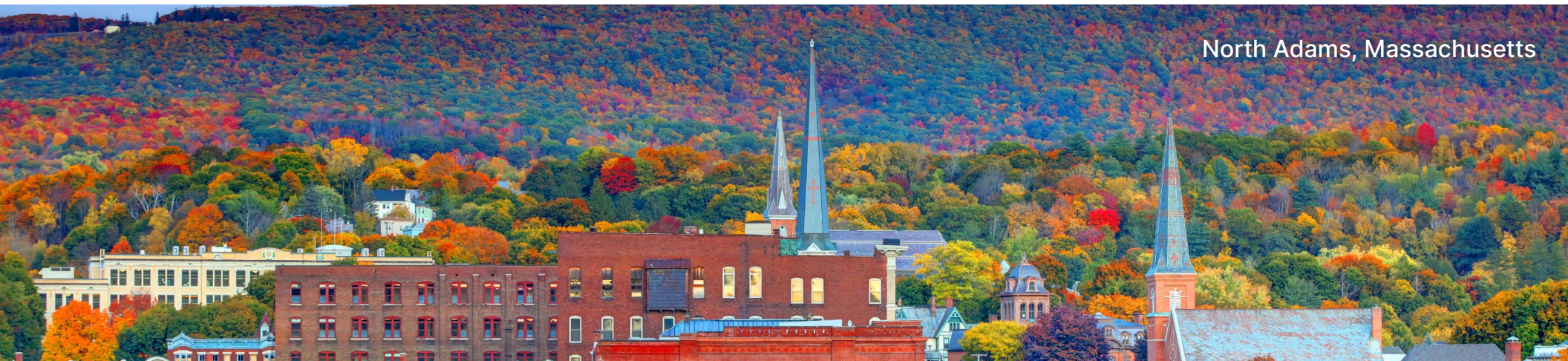
North Adams, Massachusetts

We've also seen signs that inflation may be set to pick up further, as consumer inflation came in hot in August. While still well below levels seen in 2021 and 2022, inflation remains above the Fed's 2 percent target and is trending in the wrong direction. This will be another important area to keep an eye on going forward.