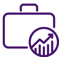
Experienced Field Leadership

LionShare is a portfolio management platform at Regal Investment Advisors. Regal is a firm built by advisors with the virtues of integrity, innovation, and independence in mind. Our founders and principals personally produce and thrive on using their experience and expertise to help affiliated advisors elevate their business to the next level. We do this through our consistent commitment to provide support and practice management resources that help and inspire independent advisors to better serve their clients.