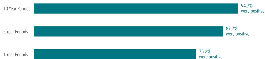
Exhibit 2. Frequency of Positive Returns in the S&P 500 Index Overlapping Periods: 1926–2018

In US dollars. From January 1926–December 2018, there are 997 overlapping 10-year periods, 1,057 overlapping 5-year periods, and 1,105 overlapping 1-year periods. The first period starts in January 1926, the second period starts in February 1926, the third in March 1926, and so on. S&P data © S&P Dow Jones Indices LLC, a division of S&P Global. Indices are not available for direct investment. Index returns are not representative of actual portfolios and do not reflect costs and fees associated with an actual investment. Past performance is no guarantee of future results. Actual returns may be lower.