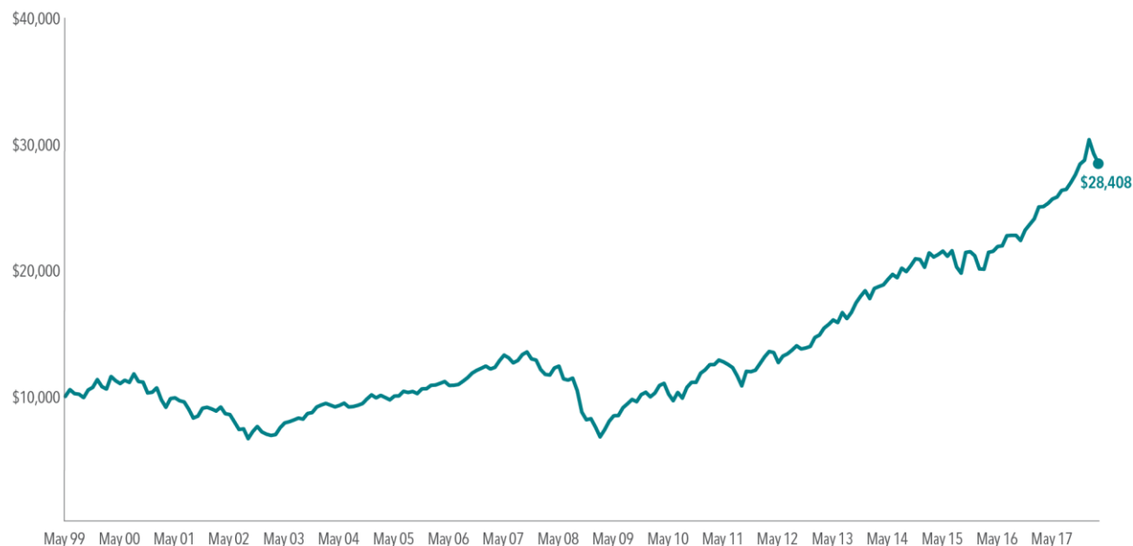
Exhibit 1. Hypothetical Growth of Wealth in the S&P 500 Index, May 1999–March 2018

In USD. © 2018 S&P Dow Jones Indices LLC, a division of S&P Global. All rights reserved. Not representative of an actual investment. Indices are not available for direct investment; therefore, their performance does not reflect the expenses associated with the management of an actual portfolio.