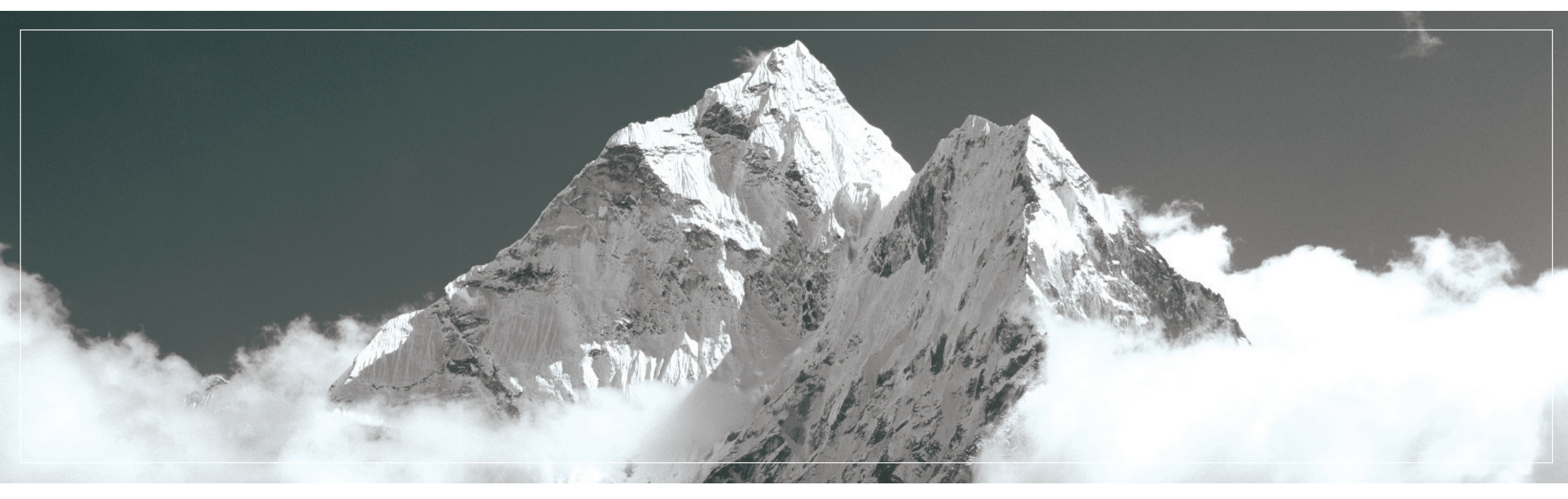
THE R.I.S.K. PROCESS | AN EFFECTIVE WAY TO BUILD YOUR RETIREMENT INCOME SURVIVAL KIT™