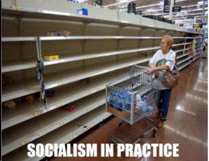
SOCIALISM IN PRACTICE