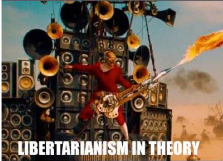
LIBERTARIANISM IN THEORY