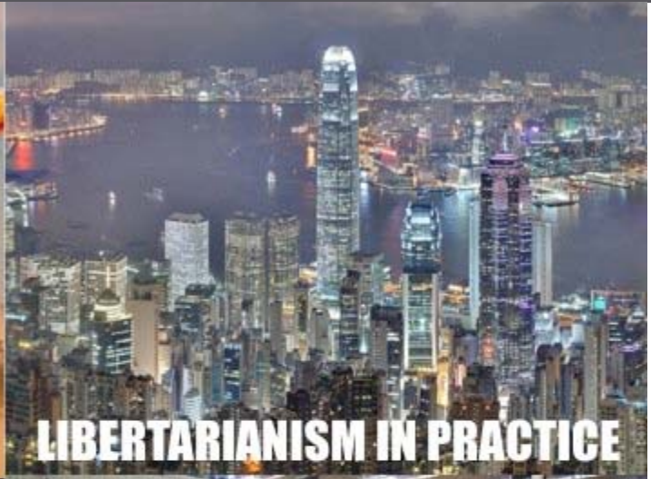
LIBERTARIANISM IN PRACTICE