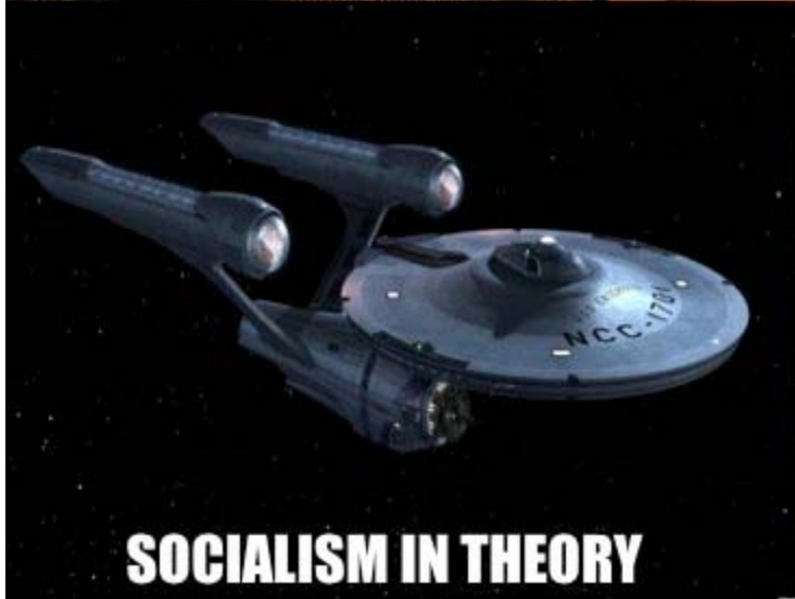
SOCIALISM IN THEORY